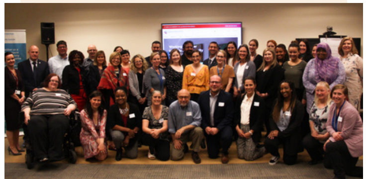
The launch of Suicide Prevention Ottawa in May 2019, with representation from The Royal, CHEO, Ottawa Public Health, Youth Services Bureau, and more.